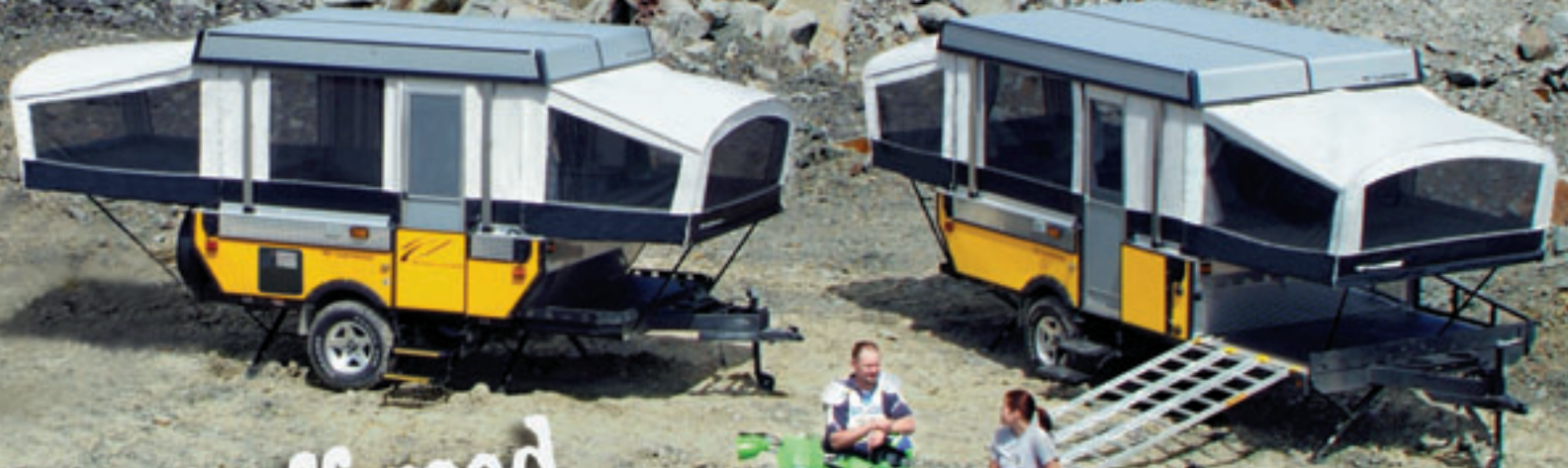
E2 shown with optional tri-fold ramp.