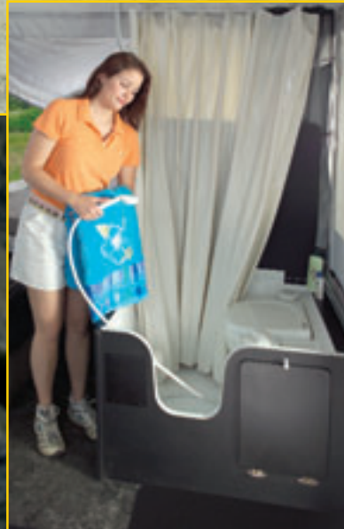
E2 COMPLETE INDOOR BATHROOM with built-in cassette potti and shower. E1 and E2 feature standard water heater and outdoor wash-down station.