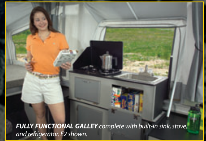
FULLY FUNCTIONAL GALLEY complete with built-in sink, stove, and refrigerator. E2 shown.